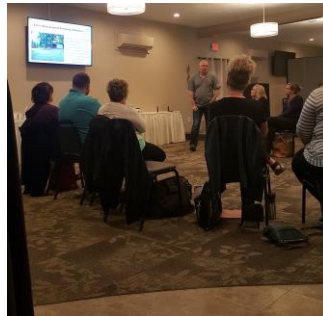
Thanks to those who attended!

During the first class, we learned about Self defense awareness, tools/resources for our safety; such as flash lights, pepper spray, cell phones. Letting someone in your office know where your showing is located. Establishing a code word when you phone your office to notify them that you are in danger and they can send help. The second part of the class was all hands on training with and without a weapon.